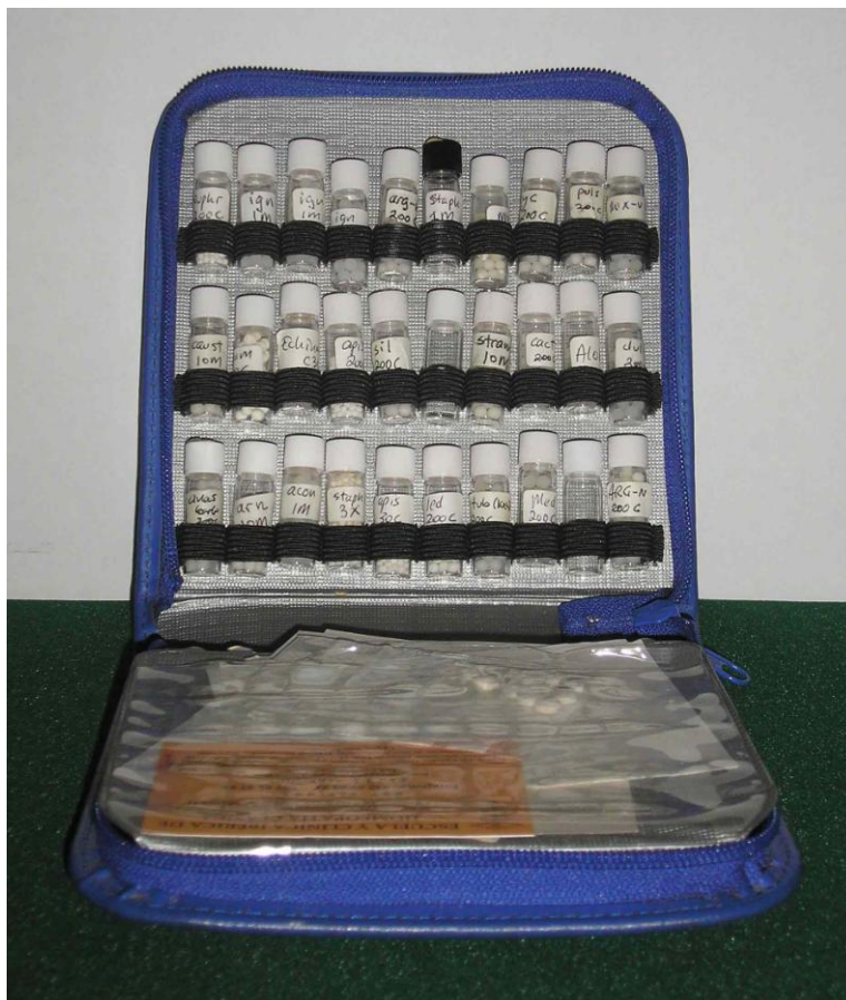
Figure 6. Large remedy kit

Also note whether the patient felt more energetic, more in harmony with himself/herself, whether symptoms moved downwards in the body, or from the inside of the body outwards. These are typical indicators of a curative remedy.