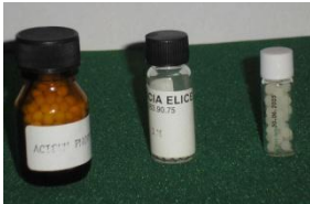
Figure 3. Three remedy flasks

Understanding this subject is very important as you may need to make your own remedies in cases of emergency, such as flu during epidemics, when a remedy is unavailable, or after natural catastrophes. Homeopathic remedies are made from solid (e.g. gold, sea salt, sand), liquid (e.g. plant juices, snake poison, milk), and ethereal (e.g. magnetic fields, moonlight, the color blue) substances. We will deal with liquids first.