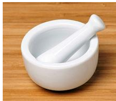
Figure 4. Mortar and pestle.

Now you have a powder which contains 1/100^{\text{th}} of a grain (60 mg) of uniformly potentised sea salt, i.e. the potency of 1C. Continue as follows: