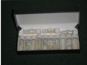
Figure 1. Carton remedy kit

Start by putting together your own personal starter kit as given in Appendix C . You will need to find a remedy supplier and a small box with vials, such as the one in the figure, that can contain the ten remedies of the kit.