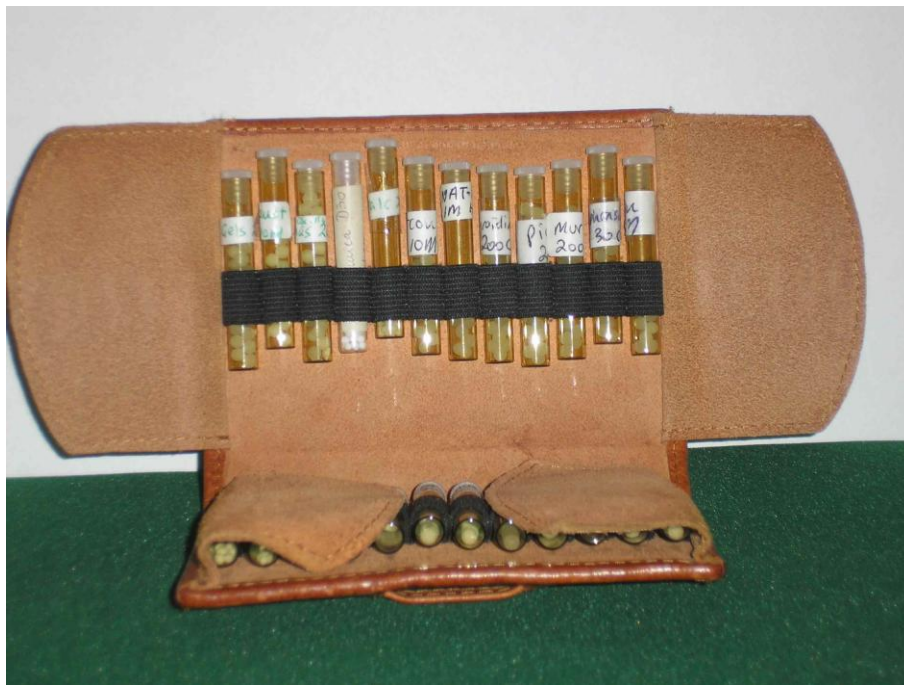
Figure 2. Leather remedy kit

Whatever you do, studying on your own, or in a professional school, extending your knowledge and practice of homeopathy will benefit yourself, your family, friends, pets and many others in your environment.